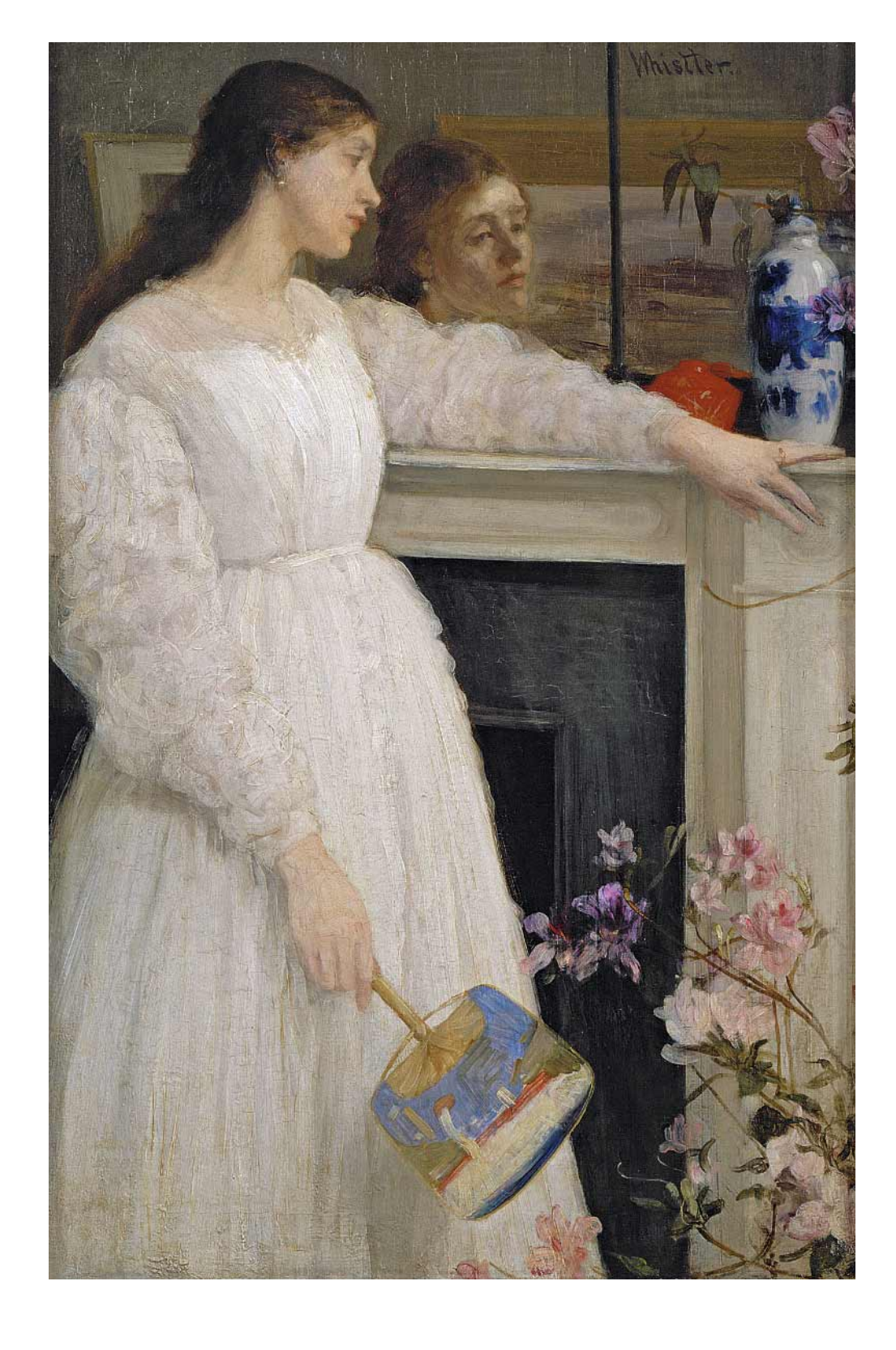
Symphony in White, No. 2: The Little White Girl, 1884, oil on canvas, 76.5 x 51.1 cm, Tate Gallery, London