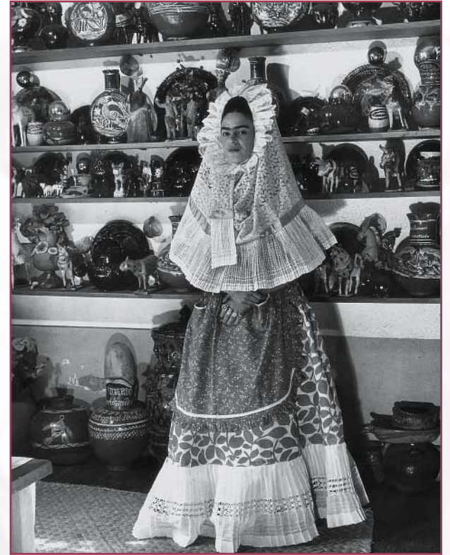
Frida in the traditional costume of a Tehuana woman in front of her collection of ethnic Mexican ceramic ware, 1942

In this picture Frida looks like an exotic princess. She is wearing the traditional costume of the Tehuana, a proud and confident people who lived in Mexico for many centuries. Frida always liked to dress up. As a young girl she often wore men's suits, and when she was older she dressed like a Tehuana woman. Lace frames her beautiful but serious face; and on her forehead, directly above her curved eyebrows, is the face of a man.