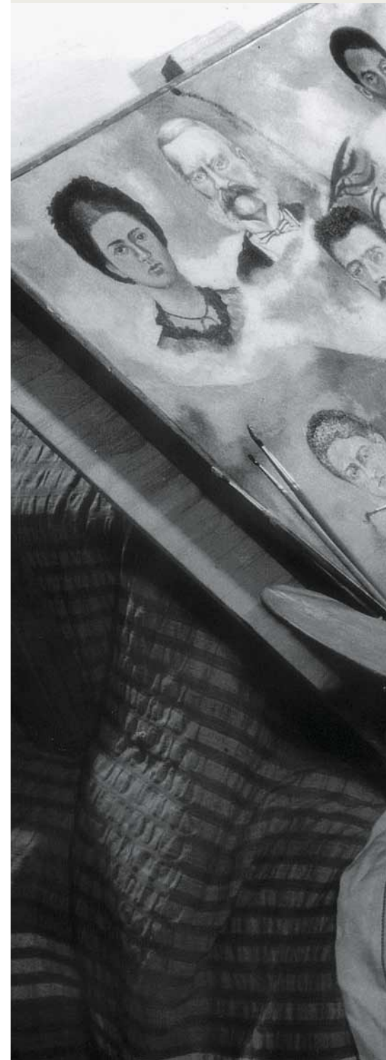
Frida Kahlo painting in bed, 1952

They are the artist's parents and grandparents.