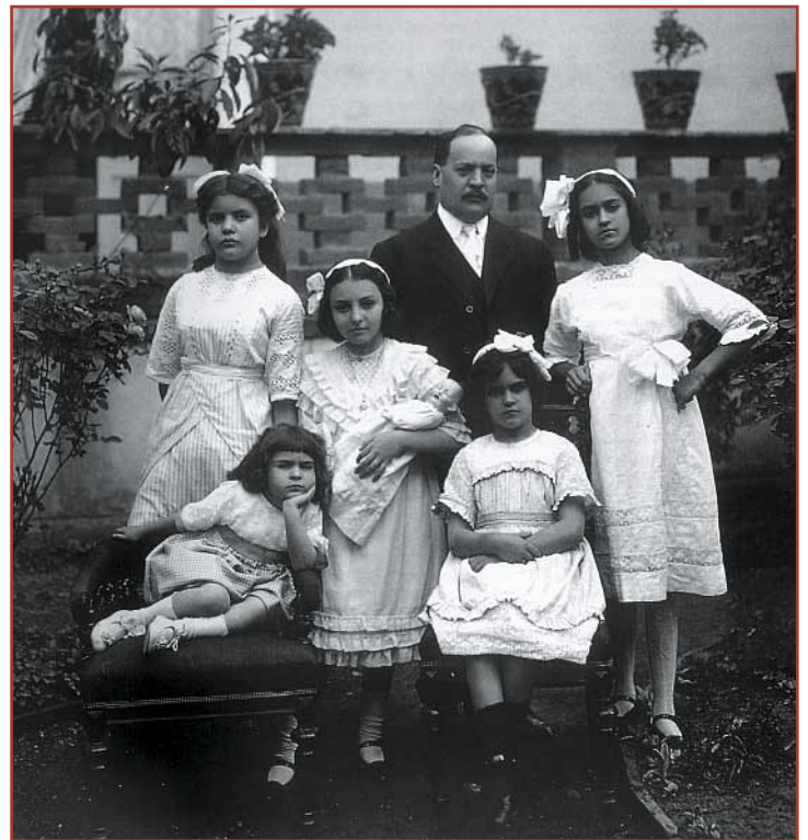
Frida Kahlo aged 5 (front left) with her sisters and other relatives, 1912

The photo above shows Frida with other members of her family taken in her parents' garden when she was a little girl.