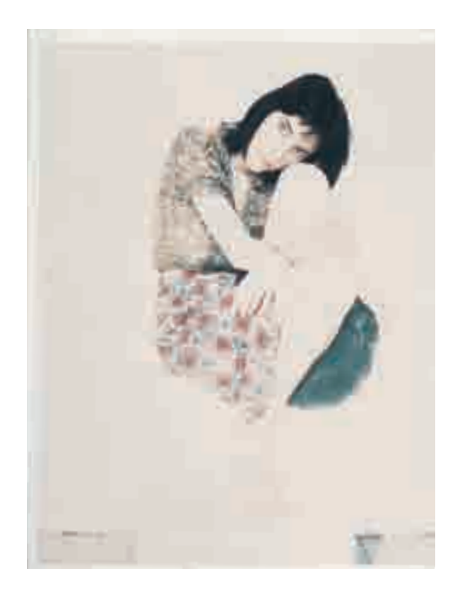
Plate 5. Untitled (Patti Smith). 1971/73