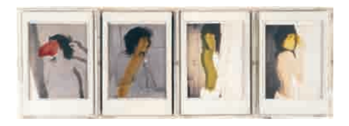
Plate 2. Untitled (Patti Smith). 1970