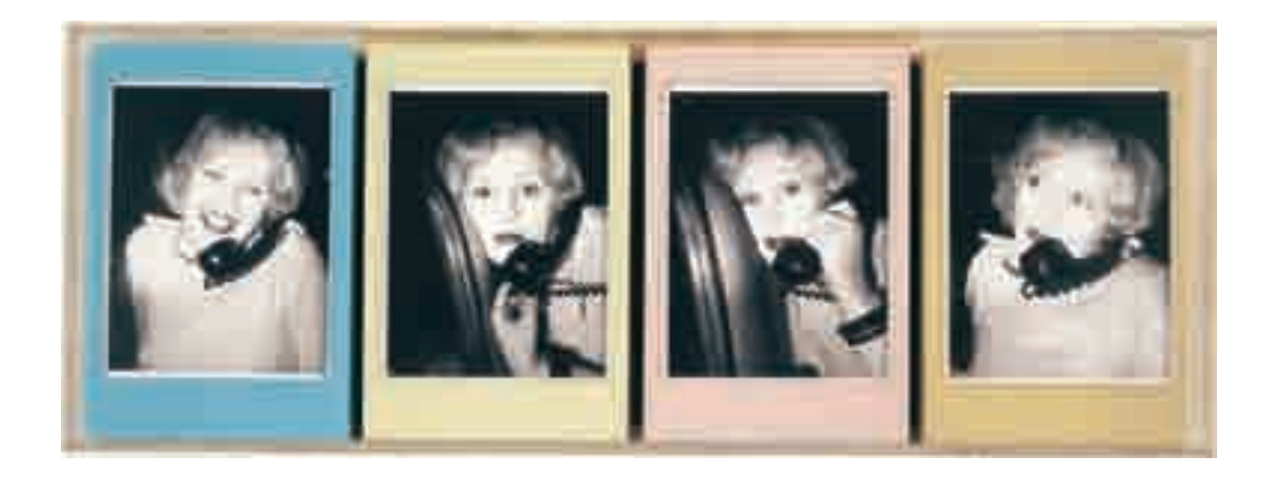
Plate 6. Candy Darling. 1973