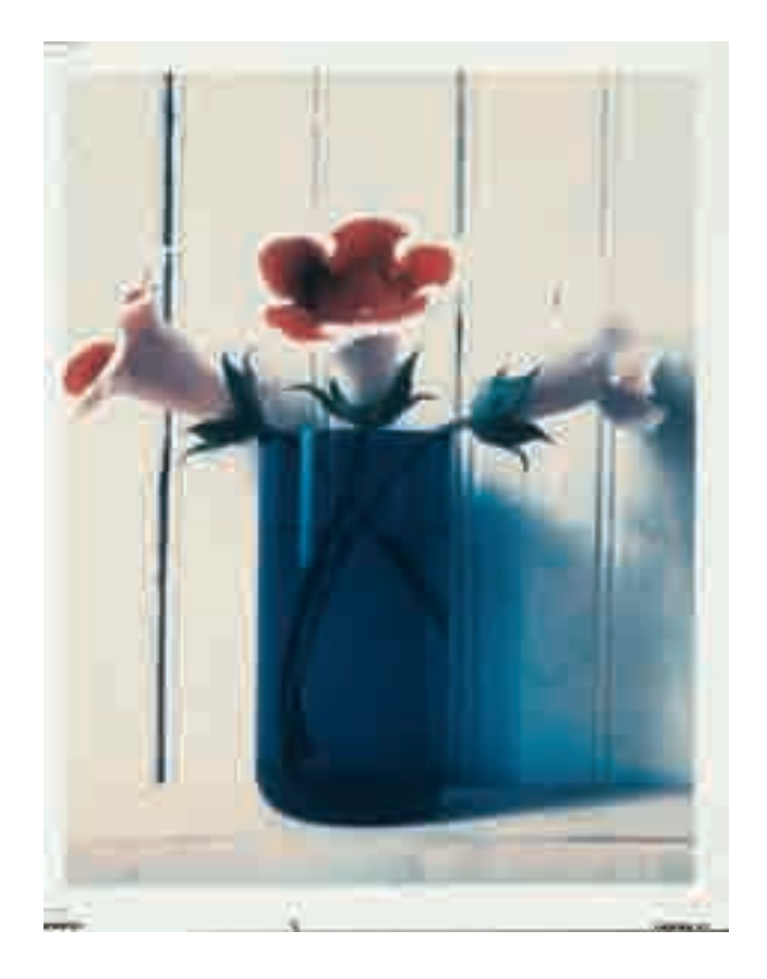
Plate 12. Untitled. 1970/73