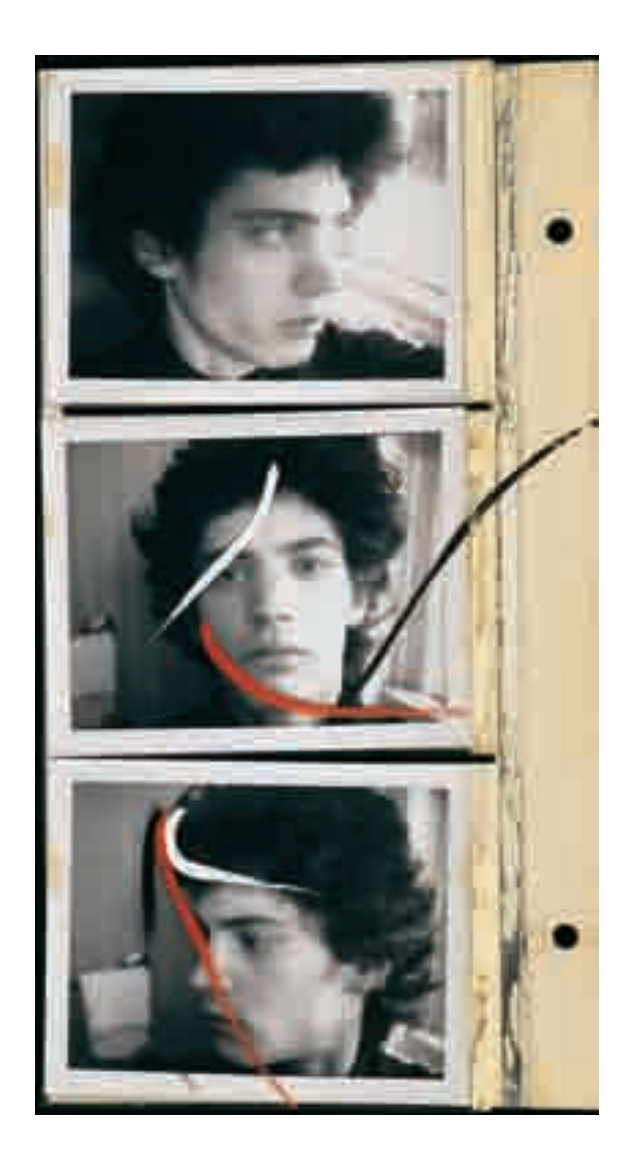
Plate 10. Untitled (self-portrait). 1970/73