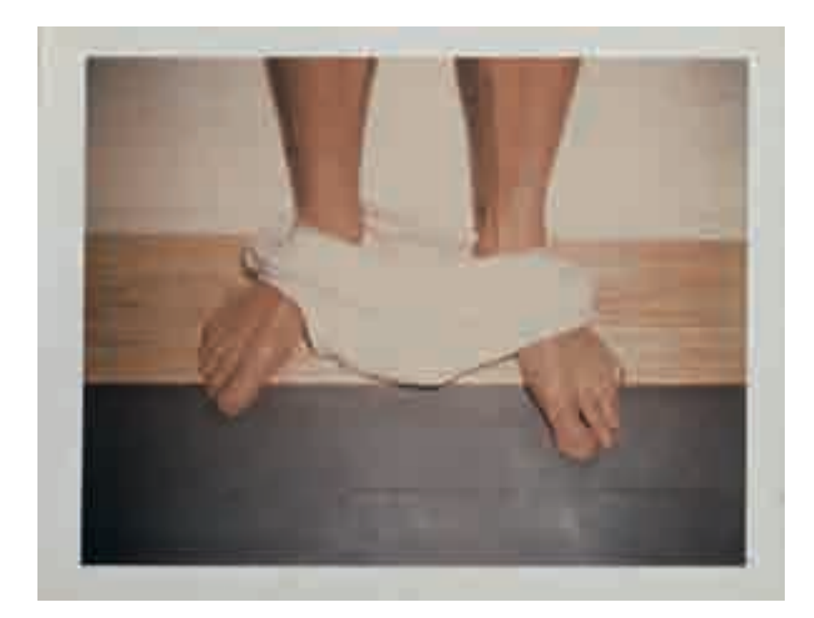
Plate 8. Untitled (Sam Wagstaff). 1972/73