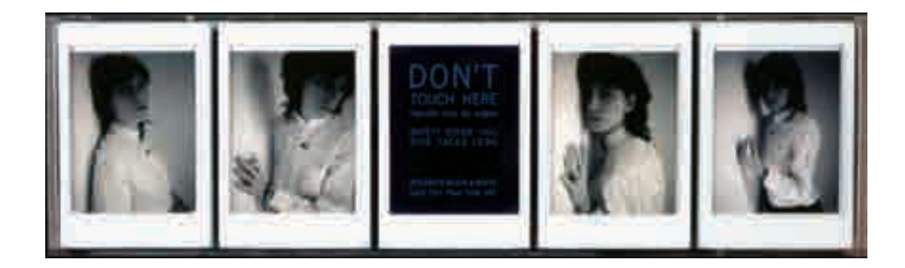
Plate 3. Patti Smith (Don't Touch Here). 1973