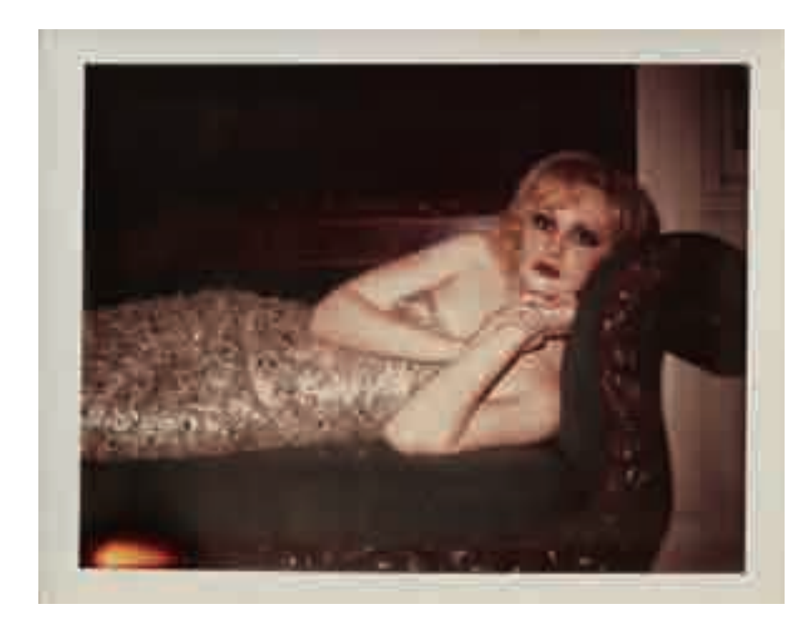
Plate 7. Candy Darling. 1971/73