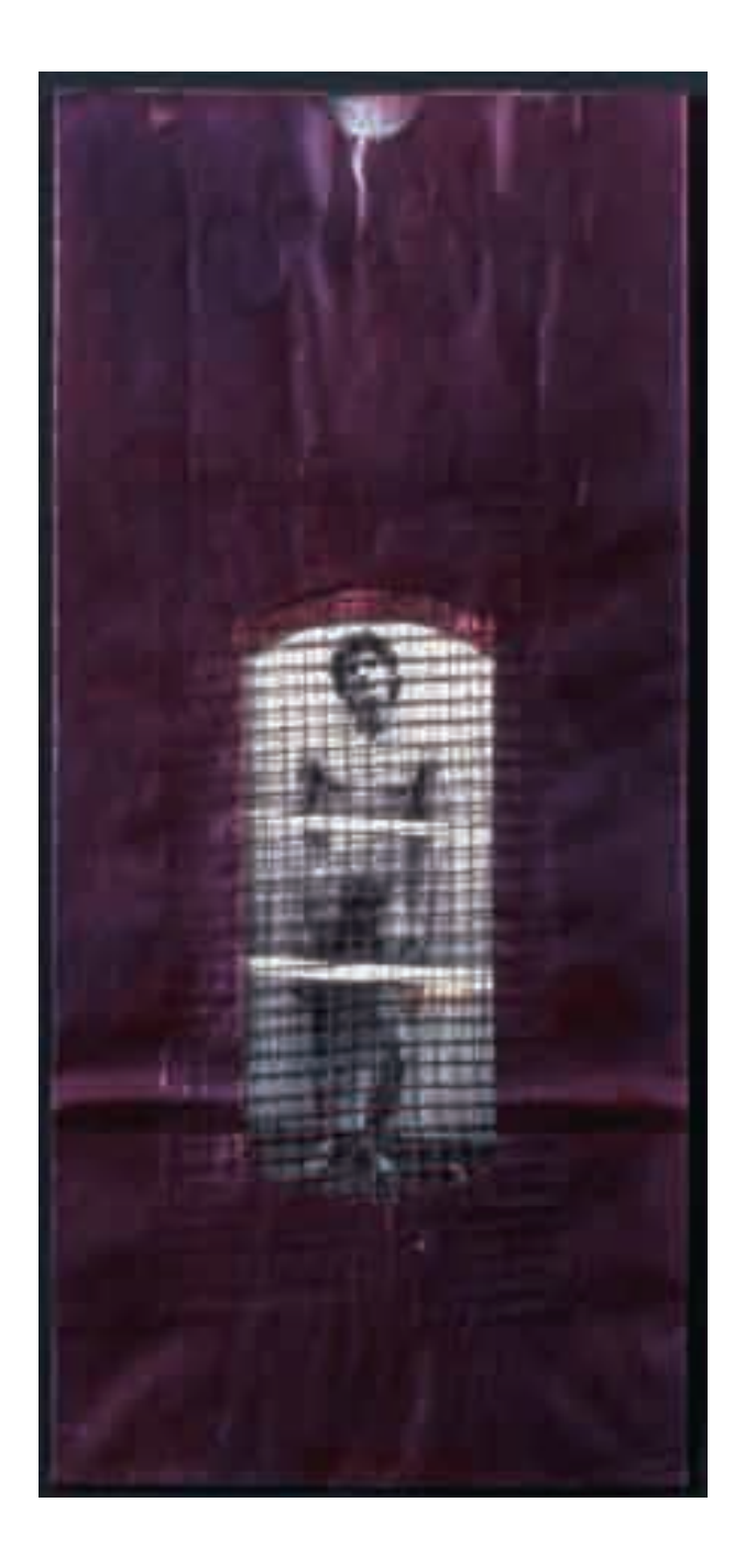
Plate 1. Untitled (self-portrait). 1971