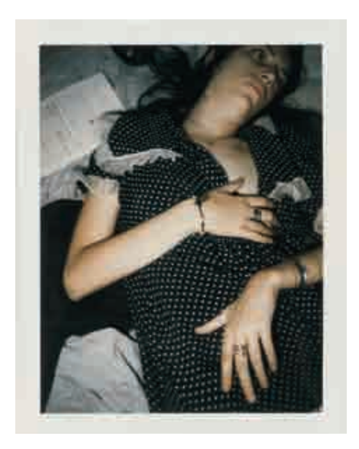
Plate 4. Untitled (Patti Smith). 1971