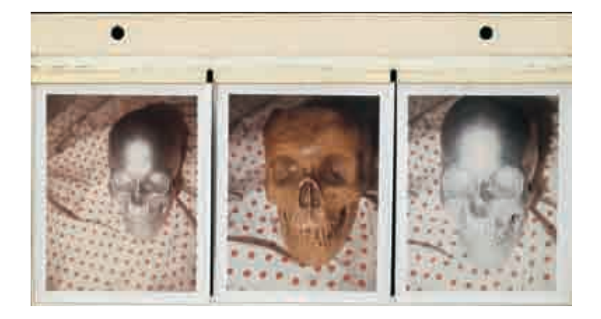
Plate 11. Untitled. 1970/73