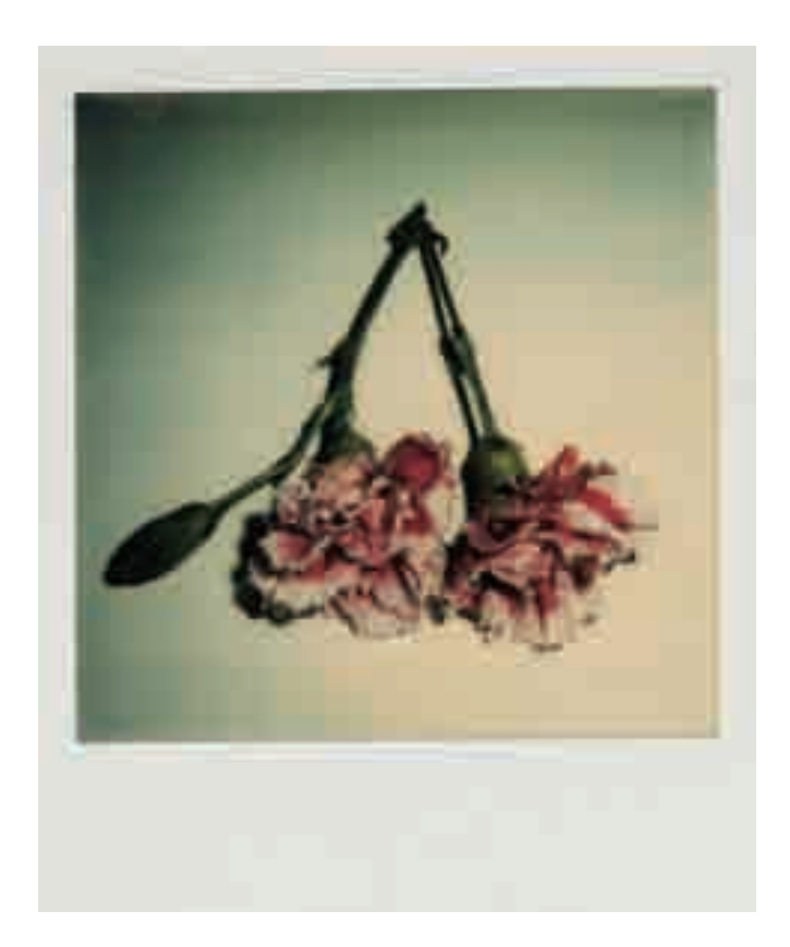
Plate 14. Untitled. 1975