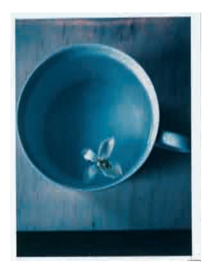
Plate 13. Untitled. 1970/73