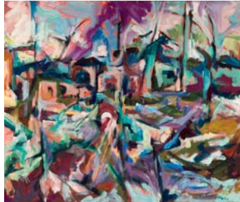
Mill Forms—Eagle Square, 1958 Oil on canvas