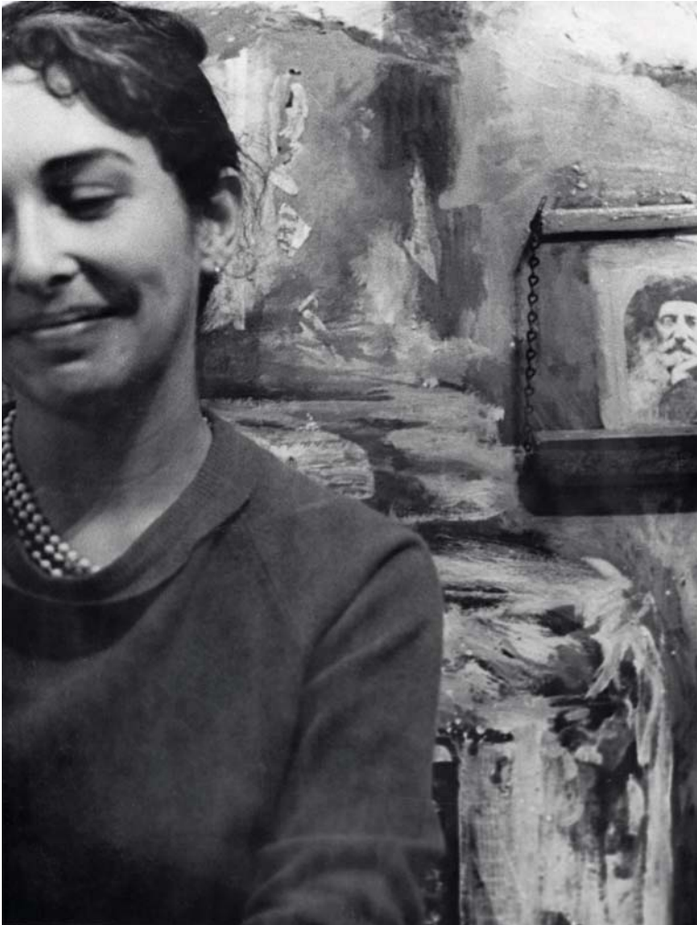
Carolee Schneemann in New York in front of Sir Henry Francis Taylor, 1961