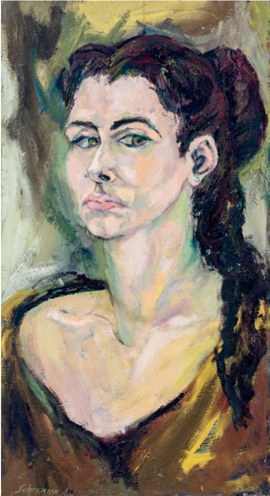
Self-portrait, 1955 Oil on canvas

I had to get that nude off the canvas, frozen flesh to art history's con- junction of perceptual erotics and an immobilizing social position. 1