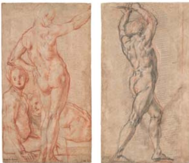
Jacopo da Pontormo, Standing Male Nude Seen from the Back, and Two Seated Nudes (recto), 16th century Red chalk on paper Striding Nude with Arms Raised (verso), 16th century Black and red chalk, traces of white chalk heightening The Pierpont Morgan Library, New York. 1954.4. Purchase

recognized that this process and the resulting art represented a major step forward in her development as an artist.