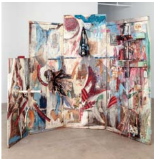
Four Fur Cutting Boards , 1963 Wooden boards, oil paint, lightbulbs, chain of colored light, plastic flowers, photographs, fabric, hubcap, tights, and motorized umbrellas The Museum of Modern Art, New York. Purchase, 2015

Schneemann continued to test the limits of what Greenberg had called a «dare.» Going even further than before, she extended her exploration of painting to include the human body, performance, photography and film. The question she asked herself was: «Can I be both image and image-maker?» 35 She had moved to New York in 1961, and although she still saw herself as a painter, she also became involved in the downtown arts scene and enthusiastically participated in avant-garde film and dance productions, Happenings, and events. Other artists asked her to perform in their pieces; she was one of the participants in Claes Oldenburg's Store Days (1962), 36 the events Rauschenberg held at his studio, and similar productions, and did a few actions configurations for photographs at Andy Warhol's Factory.