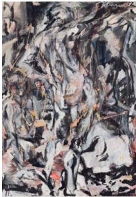
Three Figures after Pontormo, 1957 Oil on canvas