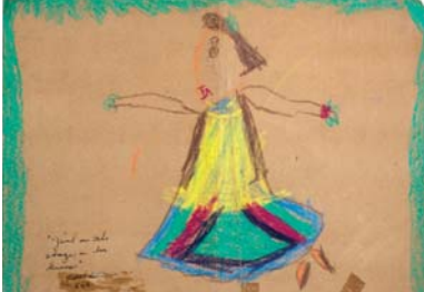
Girl on the stage, on her knees, 1940s Childhood drawing Pencil, pen, and crayon on paper

In the following pages, I will try to outline the development of Carolee Schneemann's art, highlighting her employment of different media, disciplines, and genres, from her early portraits and landscapes through her assemblages and the use of fire as a painterly material to her groundbreaking performances, experimental films, and large-scale installations in which electronic media play a prominent part. Art historians have primarily taken note of Schneemann as a pioneer of performance art and in the 1960s, as an assertive woman artist addressing issues of (female) sexuality and lust in provocative works which inevitably courted controversy. Schneemann's vital contributions to the establishment of a feminist art practice, her «painting constructions,» her choreography and performances, and her experimental films, whose full significance has not yet been recognized: these are only some facets of her oeuvre, and a thorough review of her prodigious output, which now spans six decades and reflects the period's social and technological changes in its extraordinary diversity, has long been overdue. The central idea, however, that has driven the evolution of Schneemann's creative expression has been a steadily expanding conception of painting; despite or, rather, because of the interdisciplinary nature of her process, it is aptly characterized by the notion of painting in motion— kinetic painting .