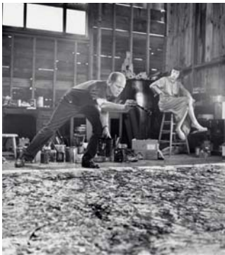
Jackson Pollock and Lee Krasner, 1950