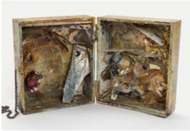
Controlled Burning: For Yvonne Rainer's Ordinary Dance, 1962 Wooden box, glass shards, mirrors, oil paint, burnt