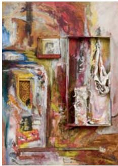
Sir Henry Francis Taylor , 1961, detail Oil paint, photographs (gelatin silver prints, e. g., Sir Henry Francis Taylor by Julia Margaret Cameron), underpants, plaster, swing glass, on Masonite panel

containers, fixing the pieces with synthetic resin, and then painted the entire arrangement. 26 She filled the boxes with straw, doused them with turpentine, lit them with a match, and quickly closed the lid. The burning time and the materials of the assemblages superseded the artist's deliberate painterly and sculptural intentions. «The resulting small conflagration heated the adhesive, which positioned the layers of glass and mirror, so when I opened the box and extinguished the fire, the fire had created the configuration in the box.» 27 Not unlike Yvonne Rainer and the other artists of the Judson Dance Theater (1962–1964), who choreographed using everyday movements («ordinary dance»), Schneemann, in the Controlled Burning series, experimented with a new form of painting using «ordinary» materials. As the nonartistic material of her choice, fire—or more precisely, the actions of igniting and extinguishing it—directed the choreography that arranged the elements in the assemblages, and thus figured as the true creative spirit behind the works. 28 Chance, which John Cage had introduced into art in the early 1950s, enters Schneemann's work in the «controlled» form of burning.