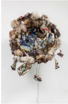
Fur Wheel , 1962 Lamp shade base, oil paint, fur, tin cans, mirrors, glass, mounted on turning wheel (motor) Generali Foundation Collection— Permanent Loan to the Museum der Moderne Salzburg Inv. No. GFO031750.00.0-2015