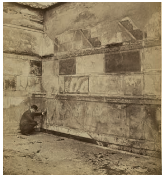
6 Alma-Tadema (?) measuring in the House of Sallust, Pompeii , c. 1863, photograph, Cadbury Research Library: Special Collections, University of Birmingham, portfolio CXXIII, 11161

Paintings of this kind began to appear at exhibition within a year or two of Lourens and Pauline's return from honeymoon. In examples such as Entrance of the Theatre (Fig. 19), 8 Glaucus and Nydia (Fig. 5, which represents characters from Edward Bulwer Lytton's best-selling novel The Last Days of Pompeii ), The Flower Market (Fig. 7) 9 and the exquisite Flowers (where the model was probably the artist's sister Artje, Fig. 8), we see the Pompeian material environment coming to life before our eyes. Roman Reading (Fig. 9) presents a male figure in deep red draperies reading from a papyrus roll; behind him is a cupboard filled with many more rolls, the ancient equivalent of a bookcase. The artist has made