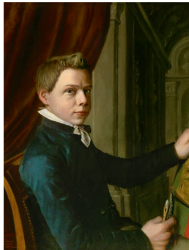
1 Self-Portrait of Lourens Alma Tadema , 1852, oil on canvas, 58.5 × 48.5 cm, Fries Museum, Leeuwarden – Collection Royal Frisian Society

According to a story recounted by his brother-in-law, Edmund Gosse, the painters of Amsterdam were not prepared to accept a Frisian pupil. 4 However that may be, it is clear that the young artist already had his sights on an international career. Within months of