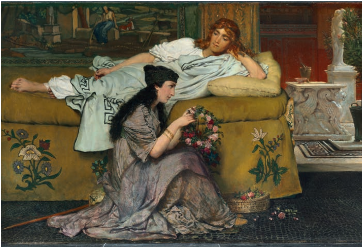
5 Glaucus and Nydia , 1867, oil on panel, 39 × 64.3 cm, The Cleveland Museum of Art, Cleveland

sleep, dream, eat, within the very walls where these Romans lived... 6