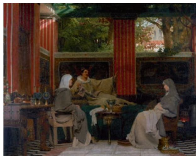
3 Venantius Fortunatus Reading his Poems to Radegonda VI , 1862, oil on canvas, 66 × 83.3 cm, Dordrechts Museum, Dordrecht