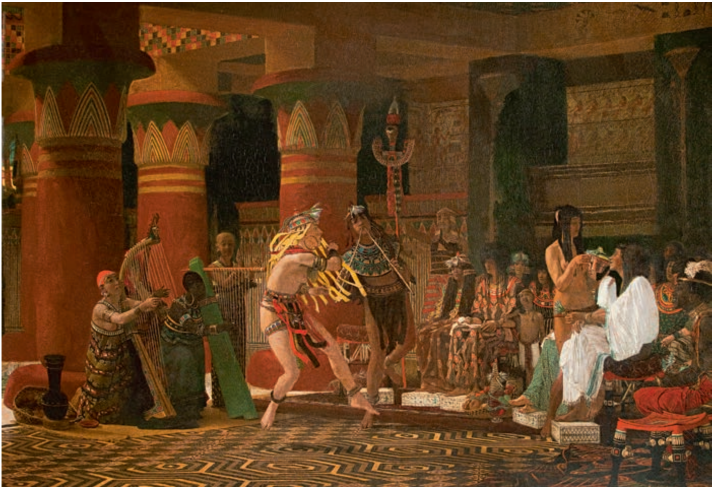
4 Pastimes in Ancient Egypt 3000 Years Ago , 1863, oil on canvas, 99.1 × 135.8 cm, Harris Museum & Art Gallery, Preston