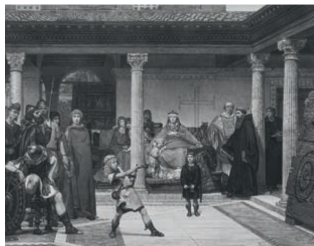
2 The Education of the Grandchildren of Clotilde , engraving by Johannes H.M.H. Rennefeld after Op. XIV, 1861, 40.8 × 49.4 cm, Fries Museum, Leeuwarden

By the 1860s travel was also becoming easier for artists, due to improvements both in transport and in the European political climate, and again Tadema was in