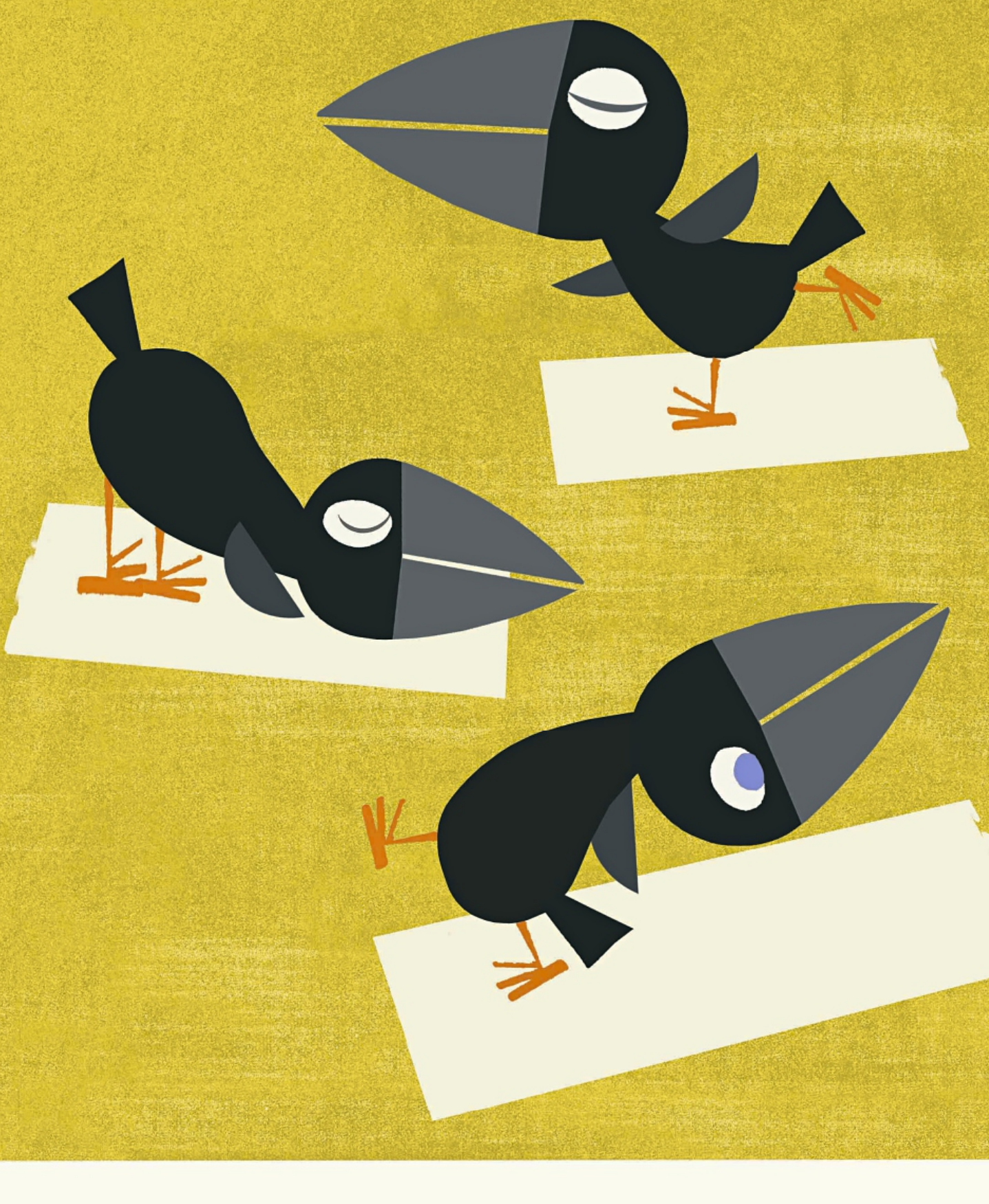
Oskar can do yoga...